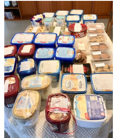
A tremendous effort from the St Luke's Bakers