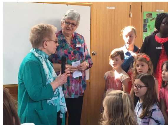
From the oldest to the youngest.