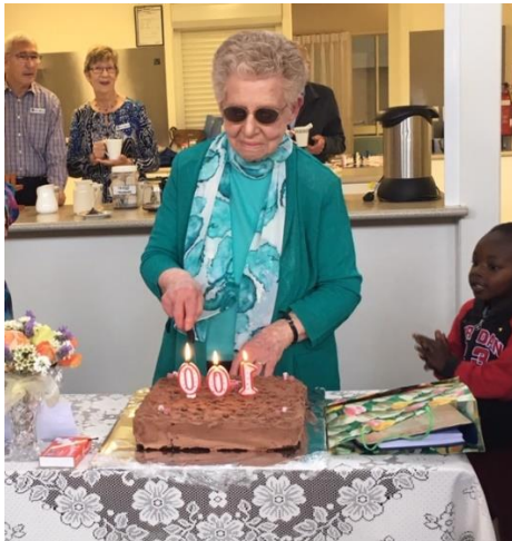
The delight of sharing a birthday